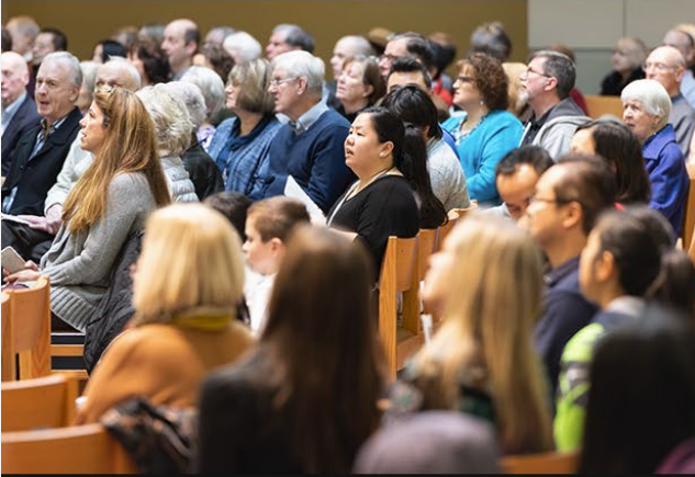
Church Streaming: Identify your Audience