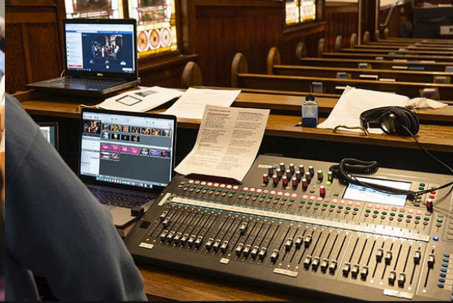
Church Streaming: How, Part 2: Video