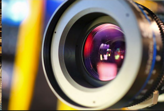
Church Streaming: How, Part 1: Your Camera